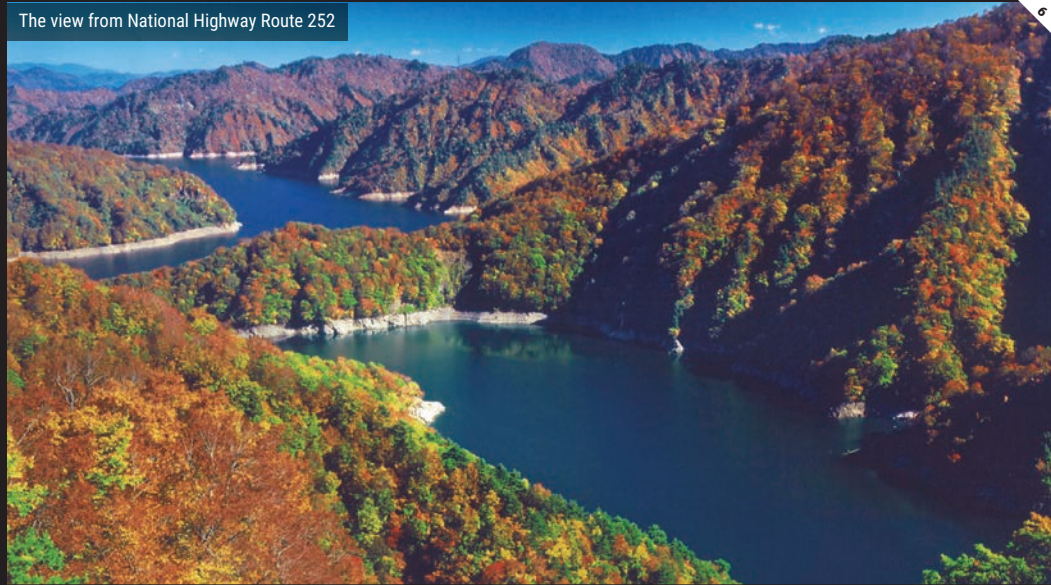
The view from National Highway Route 252

💰 Fee : 10,000 yen / 30 min. (up to 5 people) ✉ Reservations : info@tadami-net.com