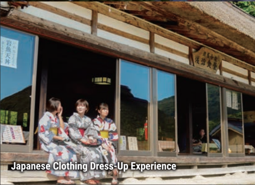
Japanese Clothing Dress-Up Experience